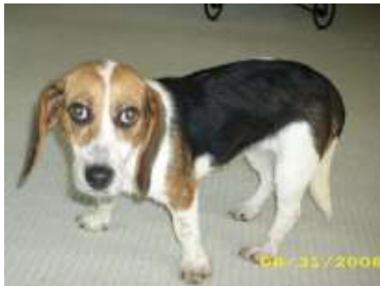
Ruby's First Day Home - August 31, 2008