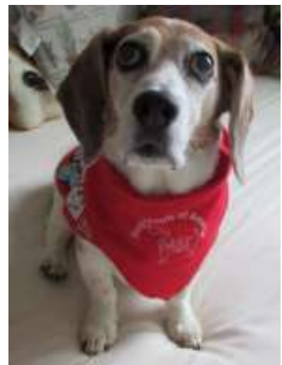
In her Dog Scout Uniform - July 2020