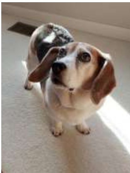
Just Being Her Cute Self - November 2021